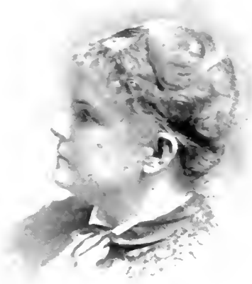
CELIA LAUGHTON THAXTER.

Western Chautauquan Association. She has refused to go regularly into council work, as it would keep her too much away from home. She has lectured before the councils on "The Kitchen as a